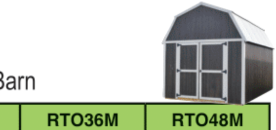
ULB - Urethane Lofted Barn